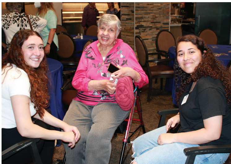
Thanks to a grant from the Murnick Family Foundation, residents were treated to a gathering with students from Israel and Israeli street food.