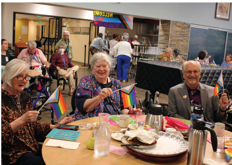
Residents and staff celebrating Pride month with entertainment.