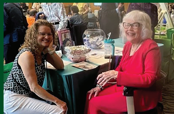
Connections were made at the Resource Fair.